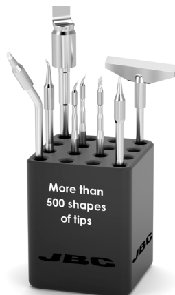
SCH Cartridge Holder